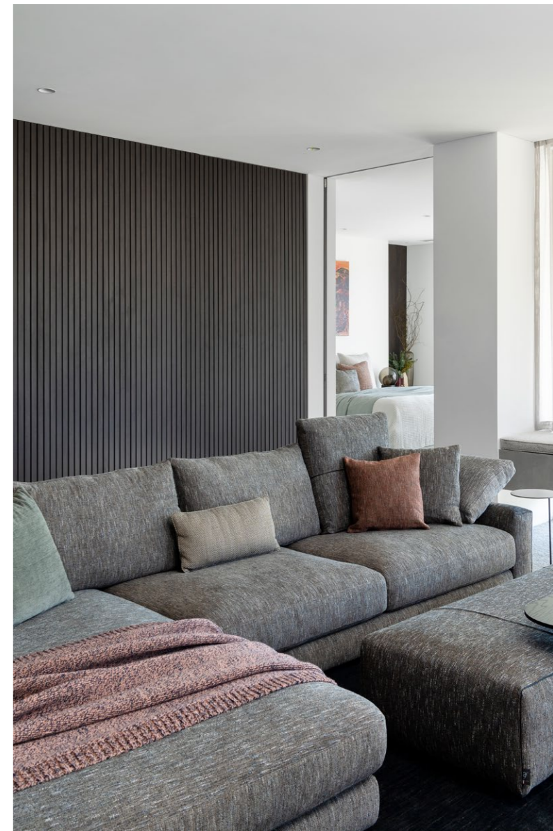
OPPOSITE. Custom designed built-in bedside tables and wall panelling provide a luxurious hotel feel. Pulpo's Boule lamp is from Ultimo and the bed linen is from L&M Home. Pilbara Glow by Magda Joubert from Linton & Kay Galleries adds colour to the space and the window treatments by Indeko Curtain & Blind Studio filter and control the light.