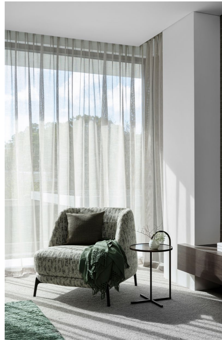
LEFT. A sheer curtain by Indeko Curtain & Blind Studio wraps the corner window and sits softly behind a Velvet armchair by Novamobili and Rolf Benz '902' side table , both from Ultimo. The Hycraft-Chatsworth carpet is from Wall to Wall Carpets.