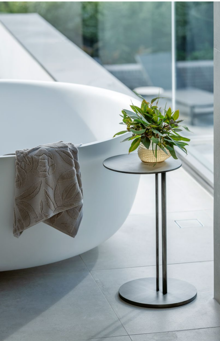
LEFT. The master ensuite includes Cattelan Italia's Sting side table and Guaxs vase , both from Ultimo. The perfectly round Fienza Shinto bath is from Reece Bathroom Life.